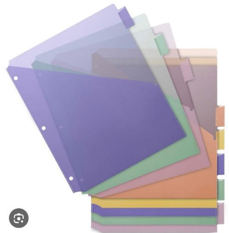
Double Pocket Index Dividers, with Multicolor Large Insertable ...